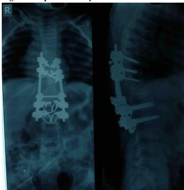
Fig 3: Post operative X-ray AP & Lateral view