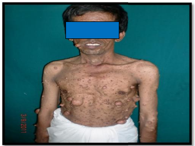
Fig.1: Multiple swellings

of nonconsanguinous marriage. None of the other siblings are affected. Chews beetle leaf and nut, non smoker, non alcoholic.