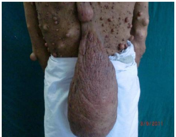
Fig:5 Plexiform neurofibroma (excised surgically)

Slit lamp examination: Lisch's nodules present. ENT audiometry: normal. This patient underwent reduction surgery by plastic surgeon.