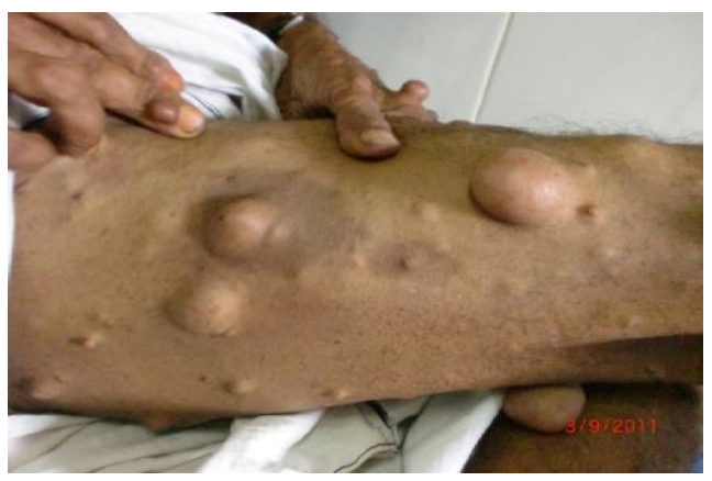
Fig-3 Café-au-liat macule

the palm(left). Axillary freckling present(Crowe's sign). Patrick-Yesudian sign – positive . Hair changes: none. Nail changes: none. Mucosa: oral and genital : normal