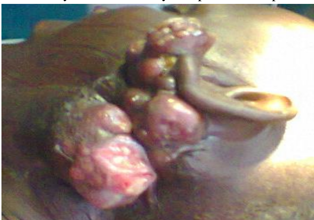
Fig 4: Extensive recurrent left parotid tumor infiltrating the skin and ear lobule