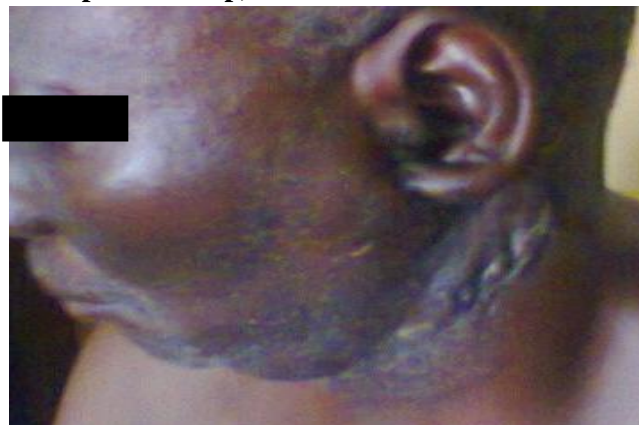
Fig 3: Post operative appearance