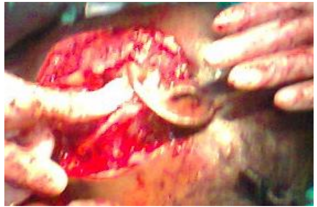
Fig 5: Defect after excision