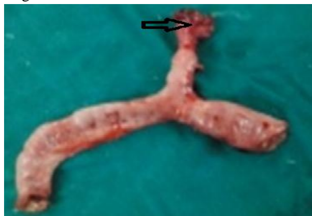
Fig.1: Resected small intestine with Meckel's diverticulum and cyst.

Case 6- Seventy five year-old male patient admitted with generalized abdominal pain, vomiting and absolute constipation since two days before admission. He gave the history of operation two years back for blunt abdominal trauma. He was taken for emergency laparotomy for intestinal obstruction. On exploration, a Meckel's diverticulum with a length of seventeen cm was found, with adhesions extending from Meckel's diverticulum to the umbilicus. Meckel's diverticulum showed gangrene. (Fig 3). Adhesiolysis and resection- anastomosis was performed. The post-operative course was unremarkable. Histopathology confirmed the diagnosis.