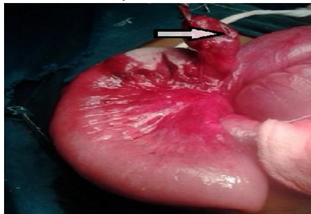
Fig.2: Arrow shows perforation of Meckel's diverticulum at its base.