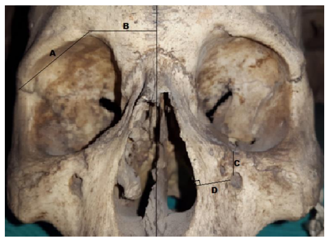
Figure 2 Periorbital Measurements A) Supraorbital Foramen-Zygomaticofrontal Suture (SOF-ZFS) B) Nasal Midline (NM)-Supraorbital Foramen/Notch (LMN-ASO) C) Infraorbital Foramen -Infraorbital Margin (IOF-IOM) D) Infraorbital Foramen-Pyriform Aperture (IOF-PA)

Morphometric data, such as lengths and volume, were expressed as mean \pm Standard Deviation (SD). The Student's T test was performed to compare the mean value of the right and left sides. A p-value <0.05 was considered statistically significant; the data was analyzed using the SPSS V.18 program.