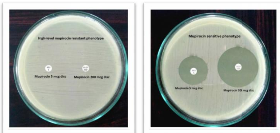
Fig.1: Demonstration of high-level mupirocin resistance and mupirocin sensitive phenotypes by disk diffusion method

done as per CLSI guidelines by Kirby-Bauer disk diffusion method for the following antibiotics: ampicillin (10 µg), ciprofloxacin (5 µg), clindamycin (2 µg), erythromycin (15 µg), linezolid (30 µg), tetracycline (30 µg), septran (1.25/23.75 µg), vancomycin (30 µg). Statistical test of significance applied z-test.