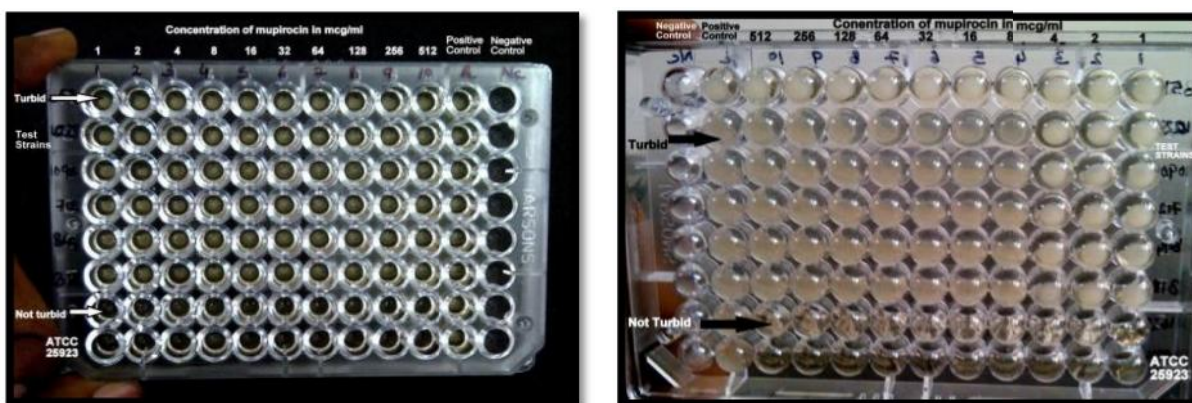
Fig.2: Broth microdilution method for determination of MIC of mupirocin in Staphylococcus aureus isolates