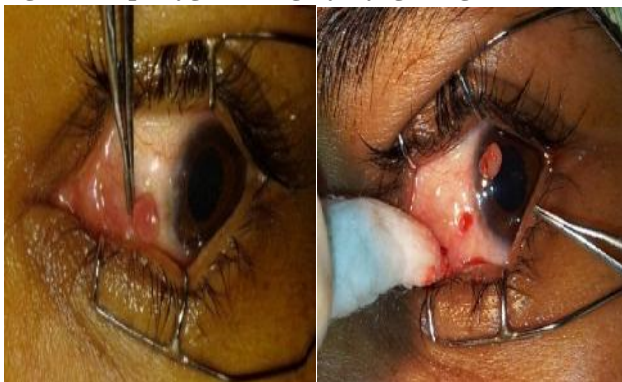
Fig 2: Surgical excision of pyogenic granuloma