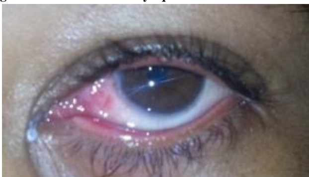
Fig 4: Postoperative