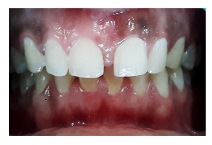
Figure 2 Midline diastema.