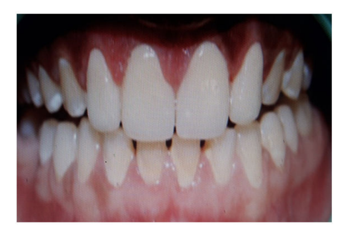
Figure 6 Post-operative with laminate veneer.